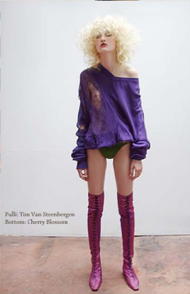
Pull: Tin Van Steenberghe Bottom: Cherry Blossom